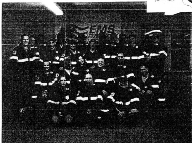
Some of our members with new safety gear, which was paid for By a Federal Grant. The rescue continues to apply for an win many Of these Grants, helping keep the cost of the department down.